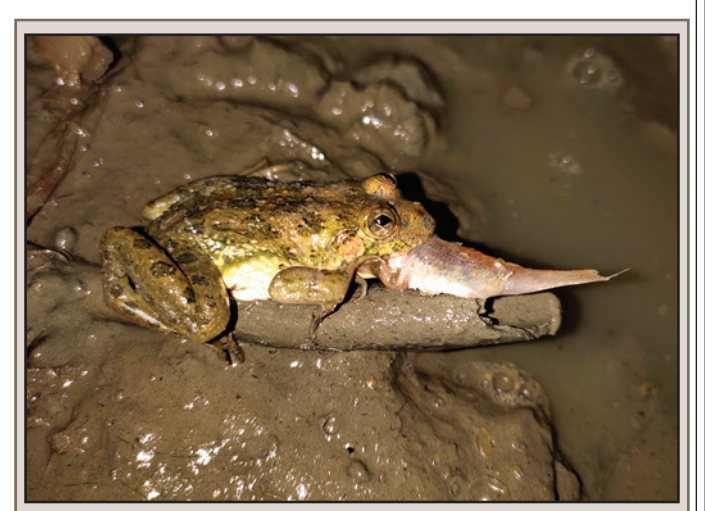
Fig. 1. Adult Euphlyctis cyanophlyctis preying on a Cyprinus carpio fingerling in Mizoram, India.

EUPHLYCTIS CYANOPHLYCTIS (Indian Skipping Frog). DIET. Euphlyctis cyanophlyctis is nocturnal and diurnal with a distribution ranging throughout southern Asia. The diet of this species is described as consisting mostly of insects (Ahmed et al. 2009. Amphibians and Reptiles of Northeast India. A Photographic Guide. Aaranyak, Guwahati, India. 169 pp.). At 1630 h on 26 May 2020, in