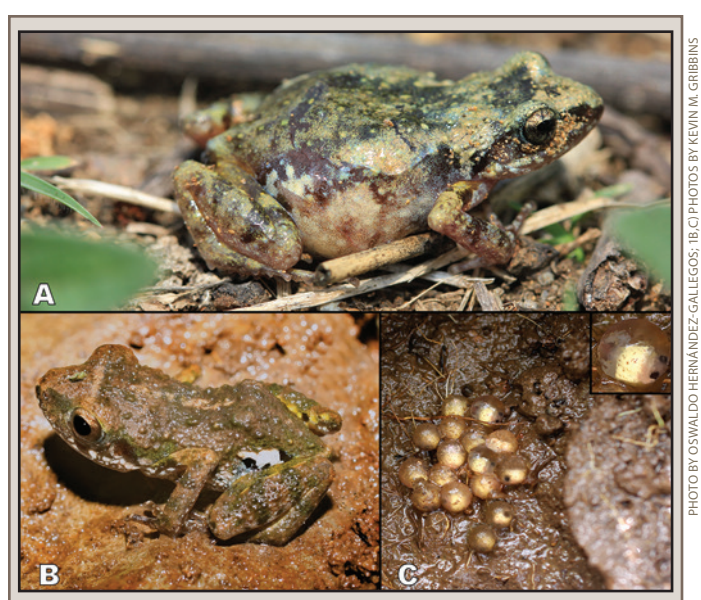
Fig. 1. A) Eleutherodactylus nitidus female observed in an urban habitat in the State of México, Mexico. B) Male protecting a nest. Note that the mature male is smaller than the female; C) Nest with 16 eggs on a muddy surface. 1A)

We present, for the first time, an observation of E. nitidus in a city (population: 35,500) during the rainy season and an additional observation of E. nitidus within its natural habitat that includes the largest clutch size reported for this species. On 27 May 2016, we found a female (Fig. 1A) in Ixtapan de la Sal, Estado de México, Mexico, within a high-traffic urban landscape (18.84278°N, 99.68083°W; WGS 84; 1800 m elev.; Fig. 2). The urban yard was surrounded by houses with an asphalt road and was composed of grass, limestone bundles, and adorned with ornate shrubs and trees of the genera Cupressus and Jacaranda . This urban habitat presented several conditions that could affect amphibian survivorship, such as permanent human presence, domestic animals, impervious surfaces, and higher temperatures when compared to neighboring natural habitat. We observed no other species of amphibians in the area, however, other herpetofaunal