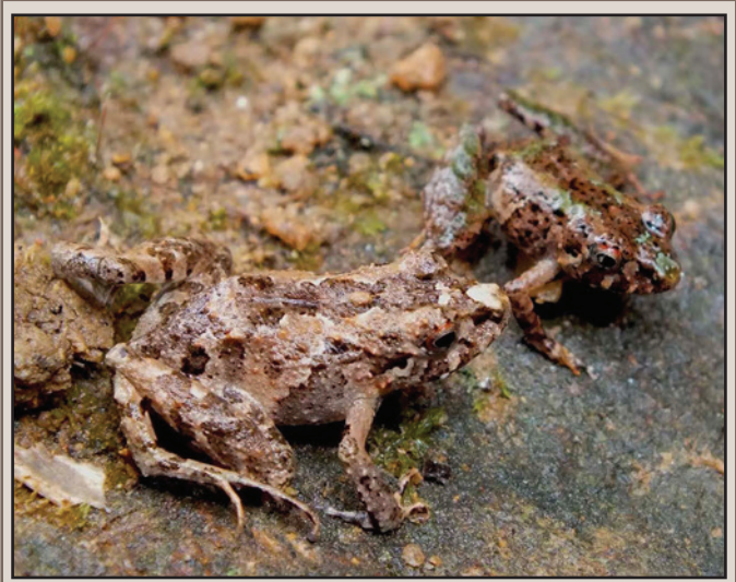
Fig. 1. Female (left) and male (right) Ischnocnema abdita after amplexus from Espírito Santo, Brazil.

Two individuals were found in amplexus on the leaf litter during nocturnal visual encounter surveys in the Monumento Natural Serra das Torres, located in the Municipality of Mimoso do Sul, Espírito Santo, Brazil (21.03391°S, 41.26085°W; WGS 84;